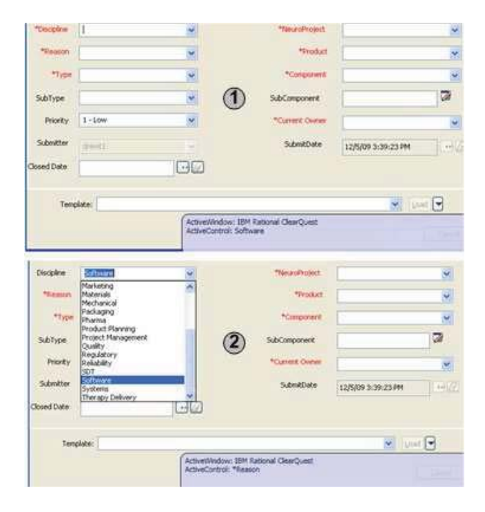
Figure 7: MAITH using Markov Model to suggest selection (in 1) and next field (in 2)

difficult to remember and slow to explore. Though traditional approaches to documenting such things exist, such as additional readme files, emails, properties of individual files, descriptive naming, and organizing folders, there is an opportunity for further improvement. MAITH allows these files and the folder structures that contain them to be annotated (see Figure 8) and otherwise supported ^{3} . Enabling one user to add a context specific annotation associated to a certain file or folder on their computer and have it generalized and shared with other users is desirable. This sort of annotation of items within a Windows Explorer window is in many ways similar to the annotation of a web or program interface described in the previous sections. As described previously MAITH associates such file system annotations with context descriptors that recognize the context regardless of how the window was opened and can easily be generalized. For example if deploying a set of shared files MAITH can recognize when any file (regardless of path) of certain name is selected. Or, for example, it can recognize all files within a certain folder or with a certain file ending and describe that they are queries and how they can be used.