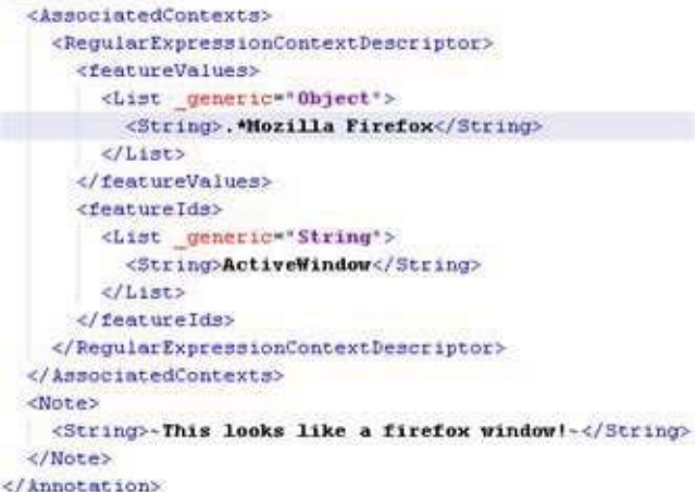
Figure 2: Example of a generalized annotation